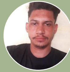
Vikas Customized Distribution channels for villagers

Adressing manhole laekage and prevent leakge with the PVC manhole and a bag