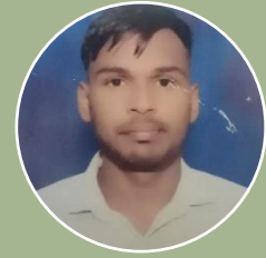
Sandeep Uniform Dress

A Social Entreprises for Providing End to End Solutions through fertilizers