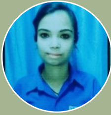
Ritika Beauty on wheels