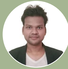
Suraj Rescue Bags & PVC Manhole

Delicious and nutritious millets based snacks