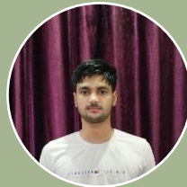
Shivam Zailark-My Virtual Closet