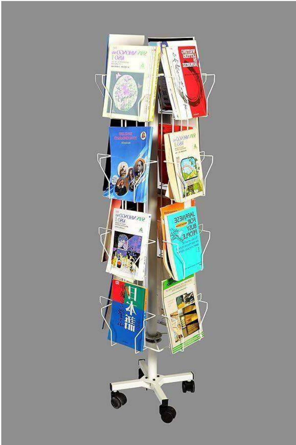
Revolving Magazine Stand